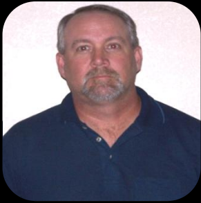
Paul Pemerton Building/Facilities